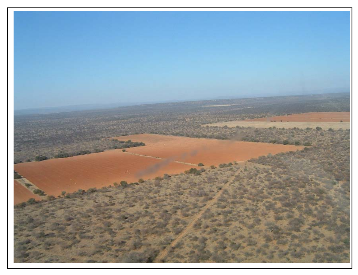
Figure 4- The vast, homogenous plains to the west of the Waterberg where the Vaalpense and their predecessors and contemporaries, the San, lived as nomadic hunters and foragers.

The Vaalpense were impoverished nomadic hunters and herders who probably did not occupy permanent settlements that have left traces on the landscape. They became subordinate to the Seleka, Langa Ndebele and colonial farmers who employed some of them as labourers.