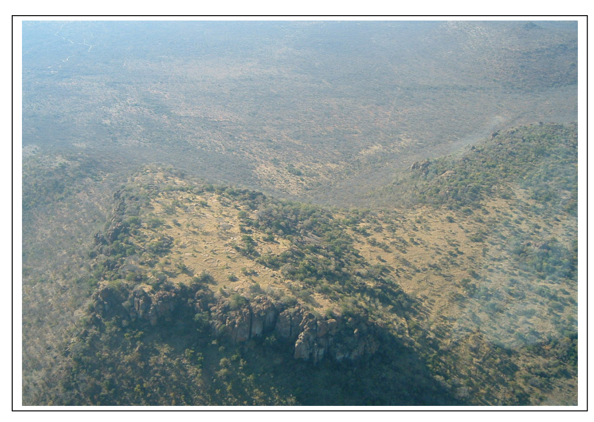
Figure 2- A Langa Ndebele settlement, possibly Thutlwane which was occupied during the nineteenth century. Note the extensive remains of stone walls on the two levels of the mountain. (The stone walls are visible as circles and lines in the yellow grass veld on top of the mountain) (above).

The second half of the 17<sup>th</sup> century seems to have been a turbulent period in Hlubi history, as the Langa clan hived off from the main body in AD1650. They were led by Langalibalele/Masebe I (Masebethêla) from Hlubi country through what is today Swaziland. Their first significant stop was near Leydsdorp or Mafefera. They moved to Bosega, an area around Bonye, east of Pietersburg, and the present territory of the Molepo chiefdom. After a short stay, the Langa moved to Thaba Tšweu (Witkoppen Mountain), a few kilometres to the south-east of Pietersburg, where they remained for four generations. The chiefs who ruled and died at Thaba Tšweu were Masebe I, Mapuso, Podile and Masebe II.