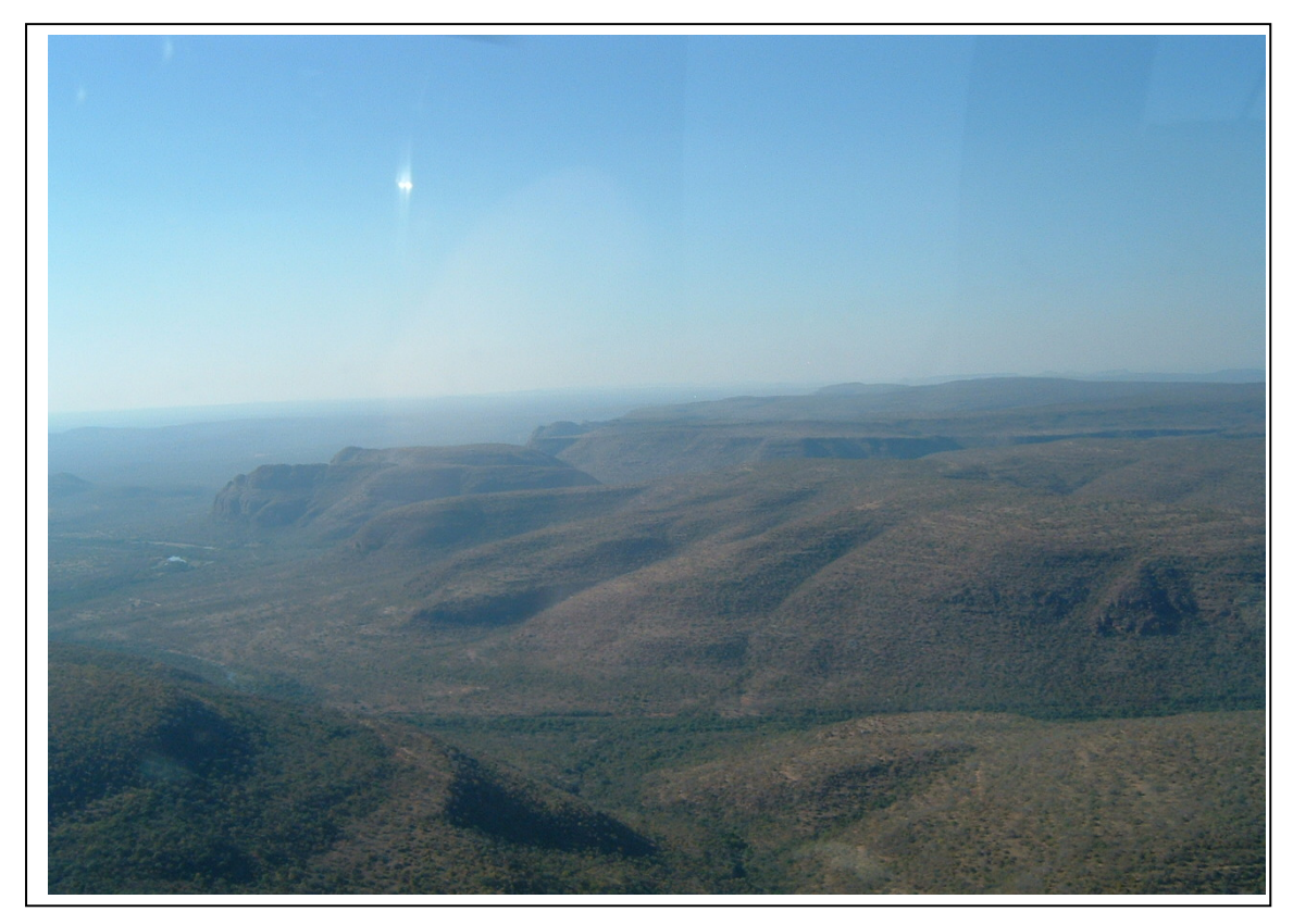
Figure 3- The northern end of the Waterberg mountains was home to San hunter-gatherers who left some rock paintings on the walls of cliffs and rockshelters. The first farmers settled more towards the open parts in the Waterberg whilst colonial settlement of this part of the Eskom Project commenced from the last quarter of the nineteenth century but probably did not exceed more than two hundred individuals by AD1900 (above).

Bambata pottery, which is associated with Khoekhoe herders, were found at Ongelukskraal and at Olieboompoort, outside the Eskom Project Area. The Khoekhoe were herders who moved southwards from Angola/Botswana through South Africa during the early first millennium AD and therefore may have had a temporary presence in the Waterberg.