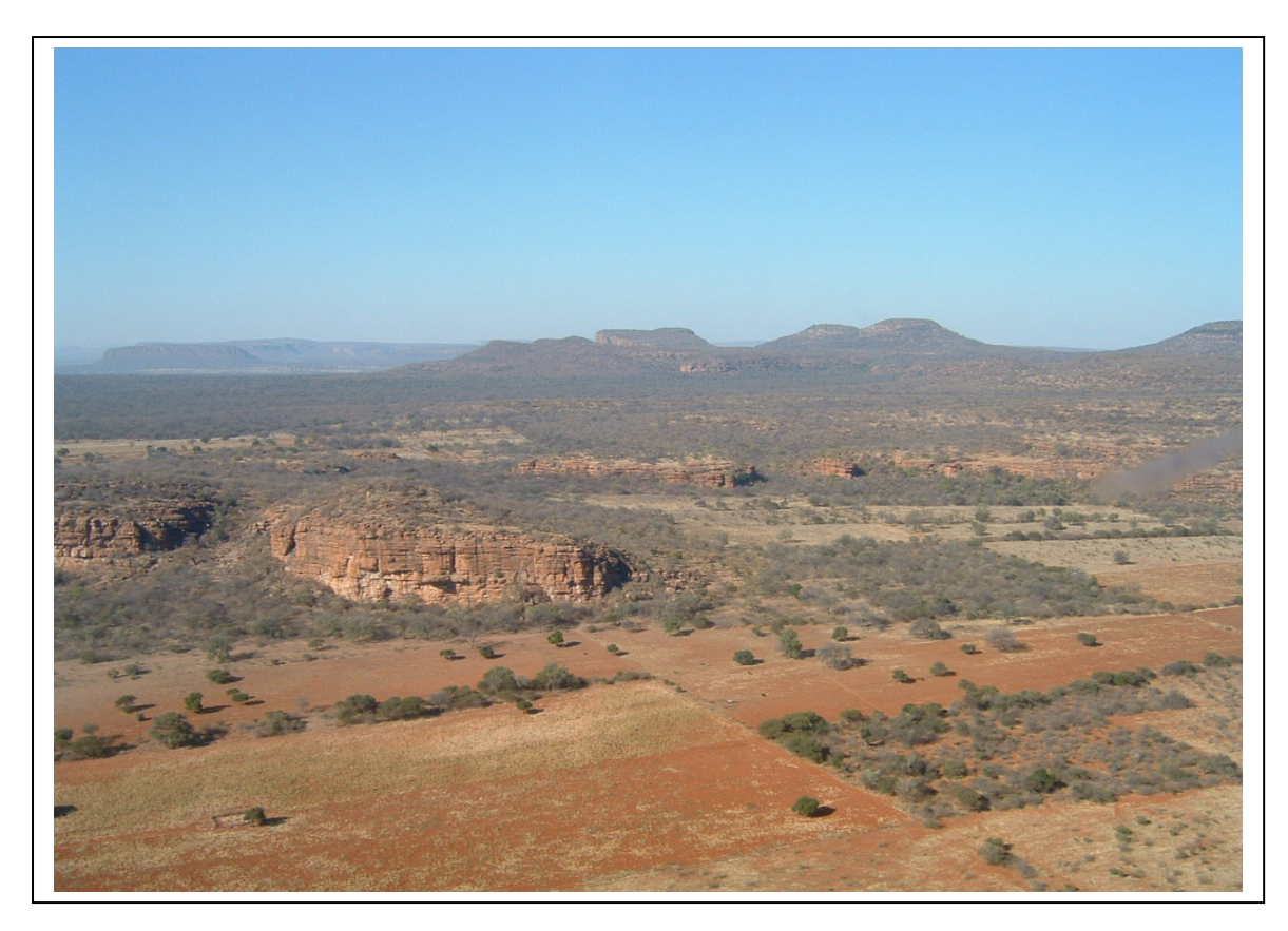
Figure 5- Flat-topped sandstone hills in the northern and north-western parts of the Eskom Project Area. Here, the Seleka-Ndebele and Shongwane clans established spheres of influence during the Late Iron Age and historical period (above).

These two clans are historically associated with flat-topped sandstone hills such as Bobididi, Magagamatala, Tafelkoppe and others. Both Bobididi and Magagamatala hold remains that may be associated with these clans as well as with the Langa Ndebele. These Late Iron Age and historical communities probably practised a mixed farming existence as well as metal working in this harsh environment as remains at some of these sandstone hills still attest.