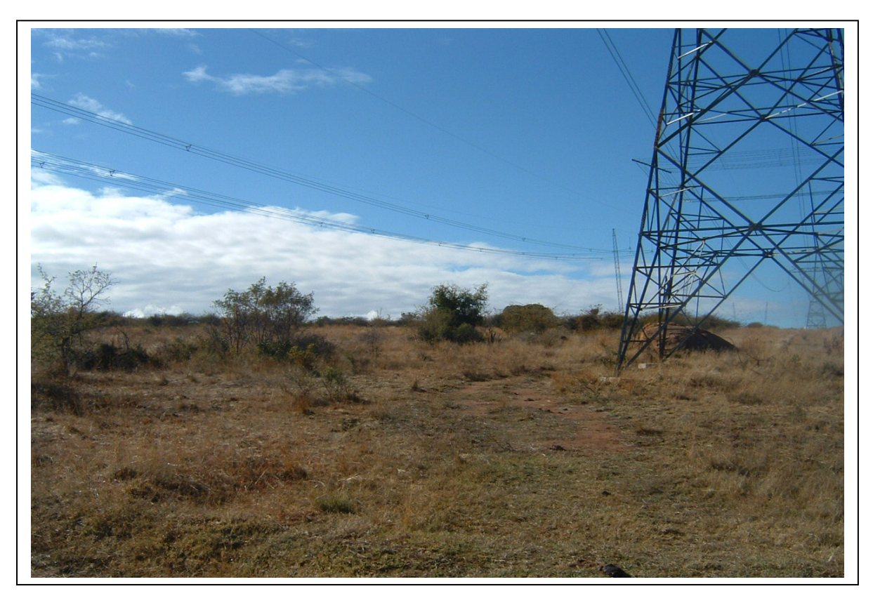
Figure 6- Option 01 for the proposed Mokopane Substation on the farm Doornfontein 721LS

Option 01 for the proposed new Mokopane Substation has also been partly affected when Eskom's existing 2X400kV transmission lines were constructed across Doornfontein 721LS