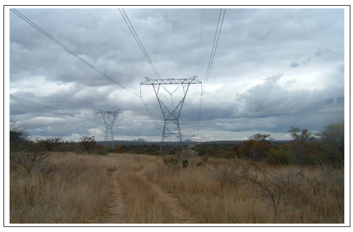
Figures 8 & 9- Option 03 for the proposed Mokopane Substation on Zuid Holland 773LR (above) and a Victorian/Edwardian farm house in a small cultural landscape to the north of Option 3 (above and overleaf).

Stone walls, probably the remains of a village dating from the more recent past, occur to the south-east of the proposed site for the substation. These remains have low significance.